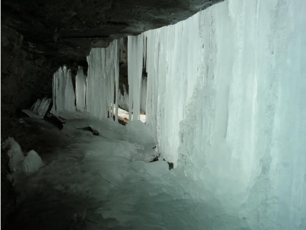
Jacoby Falls - a frozen wonder

We met some great people and have new friends after this adventure. We all experienced the falls in our own way. Jacoby Falls is a special place worth visiting any time of year in any weather.