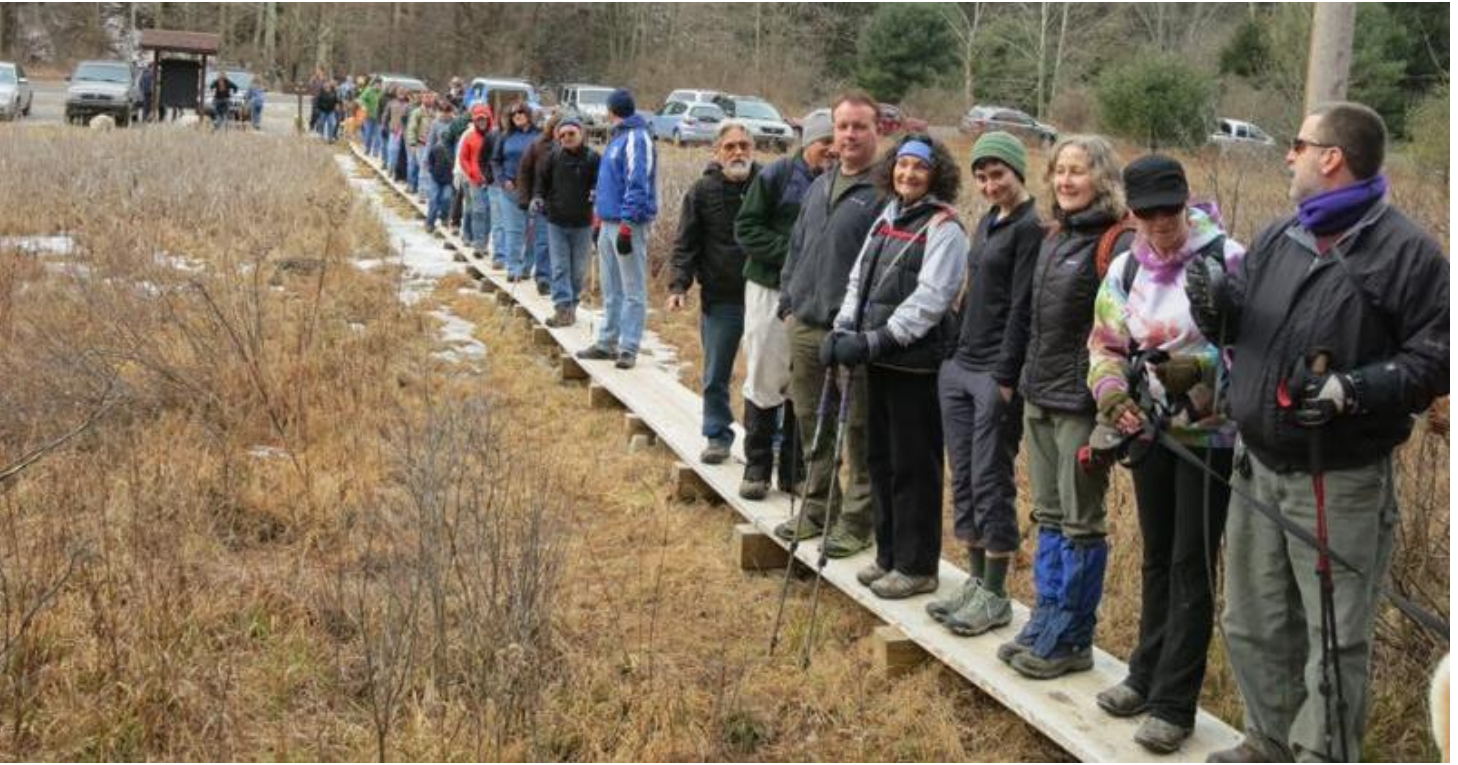
Keep it Wild hikers line up for the Jacoby Falls hike in the Loyalsock State Forest

"A primary object should be the education of our youth in the science of government. In a republic, what species of knowledge can be equally important? And what duty more pressing than communicating it to those who are to be the future guardians of the liberties of the country?"