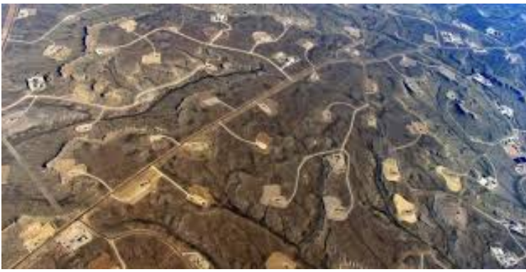
Natural gas extraction

So where do Americans stand on the issue of GW and our human contribution to it? A Gallop poll in March of this year indicated 64% were worried a great deal or a fair amount about this issue . Then in April a National Geographic WILD poll found "...94% of Americans believe our planet is warming and 87% that humans contribute at least a little bit to climate change ." An overwhelming number of scientists agree that the planet is warming and humans are the primary cause. Temperature tracking indicates that "most of the warming occurred in the past 35 years, with 15 of the 16 warmest years on record occurring since 2001 ." The U.S. Defense Department believes that GW will aggravate a number of problems that will lead to further political instability in the world .