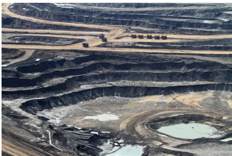
Canadian tar sands