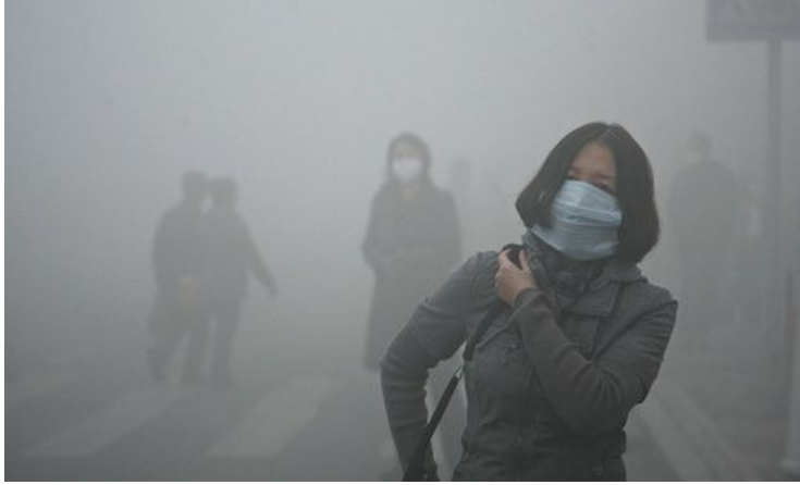
China (all pictures of Beijing)