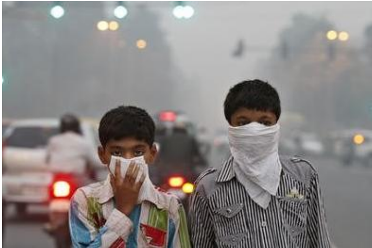
India (various areas shown)