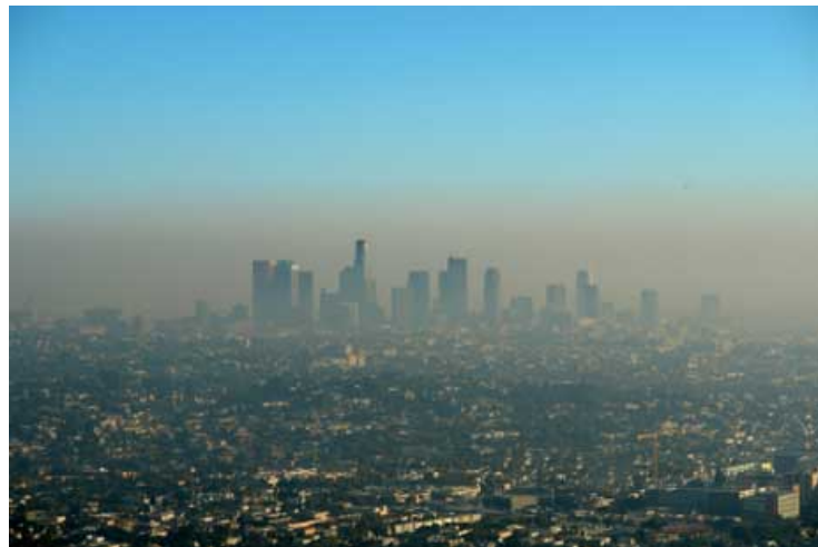
United States - Los Angeles (various CA areas shown)

PA residents should be aware that Pittsburgh is close behind several of those California areas in PM2.5 pollution, the fine particles generated from fossil fuel burning that cause a wide variety of health problems.